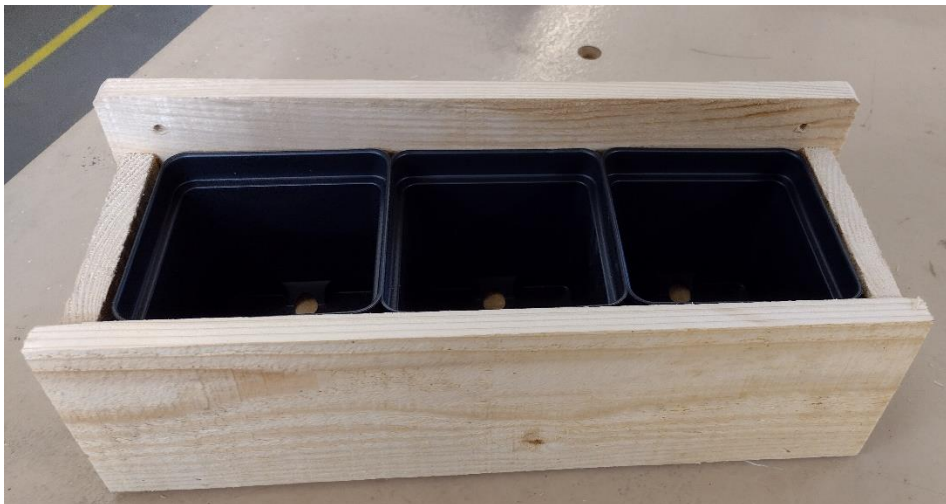
Project with 4" pots