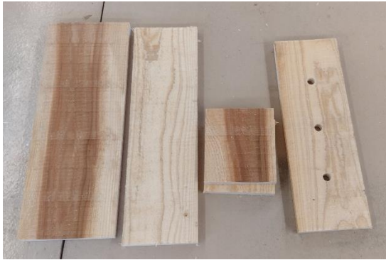
Cut out pieces