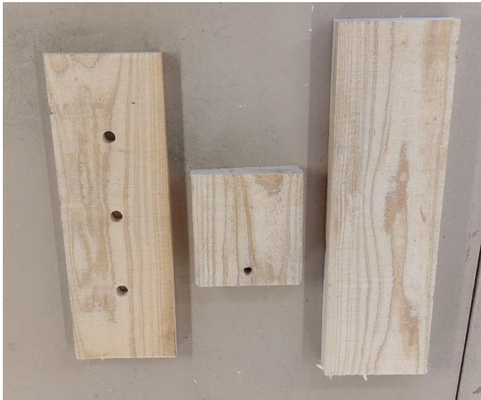
Cut out pieces